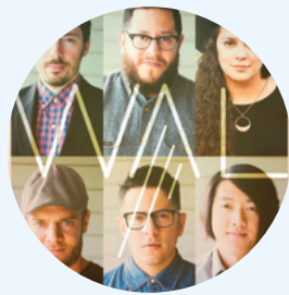
WAL May 29 • Chaminade Julianne Catholic HS • Concert & Mass with the Archbishop