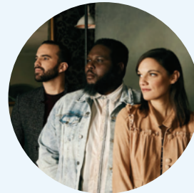
Village Lights June 19 • Cincinnati Fountain Square Event